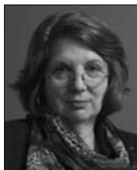
Marsha M. Linehan, Ph.D., ABPP University of Washington President, Society of Clinical Psychology

Dear readers, consider the following quotations: