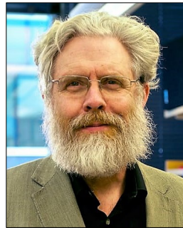
George Church Harvard/MIT