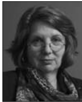
Marsha M. Linehan, Ph.D., ABPP University of Washington President, Society of Clinical Psychology

Dear readers, consider the following quotations: