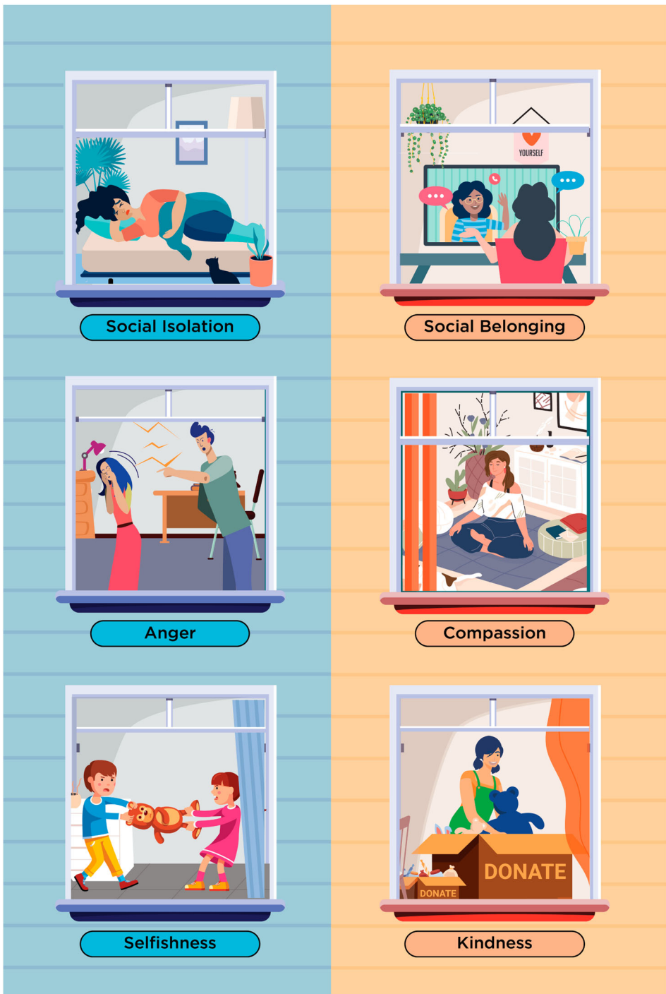
Figure 1. Evidence-based strategies for promoting individual and collective resilience during the COVID-19 pandemic, as well as recovery and growth following the pandemic. They include fostering social belonging, compassion, and kindness.